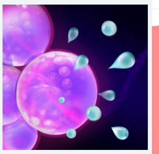
Pores form on the adipoc allowing fatty acids and water glycerol to spill out