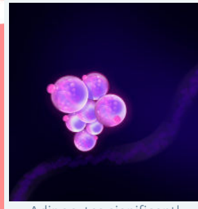
Adipocytes significantly reduce in size with the blood vessels unaffected

SAFETY: UltraSlim® treatments use the only body contouring device which is rated a Risk Group 1, the safest category of medical devices – same risk group as a tongue depressor.