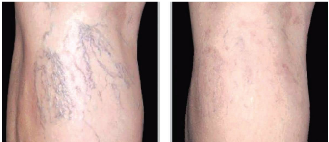
BLUE RETICULAR VEINS