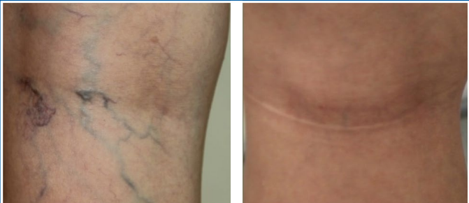
GREEN RETICULAR VEINS